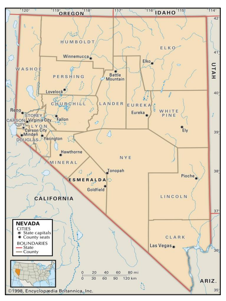
Map courtesy of Encyclopaedia Britannica, Inc., copyright 1998; used with permission.